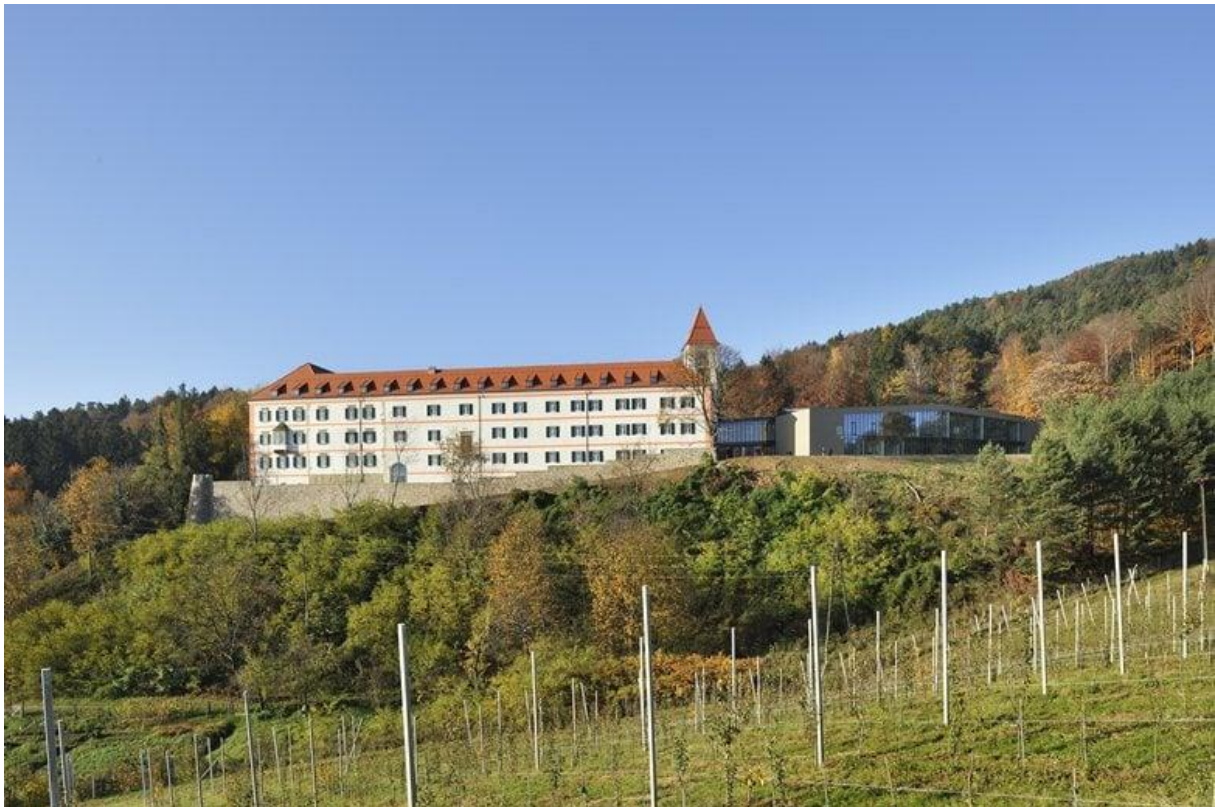
Faculty of agriculture and Life Sciences