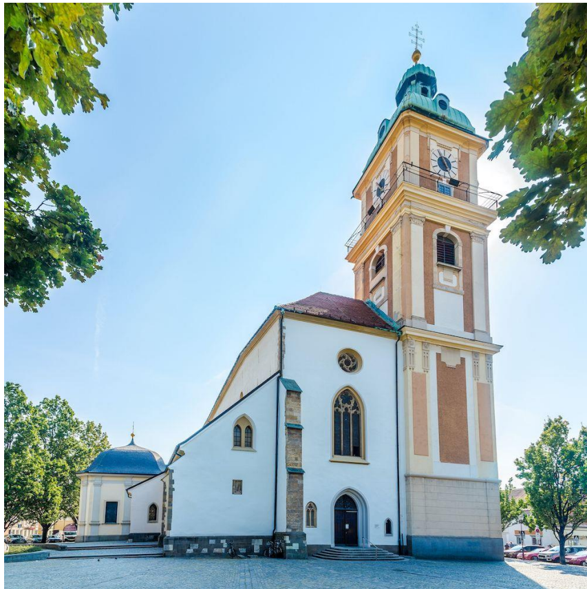
Cathedral of St. John the Baptist in Maribor (12th century)