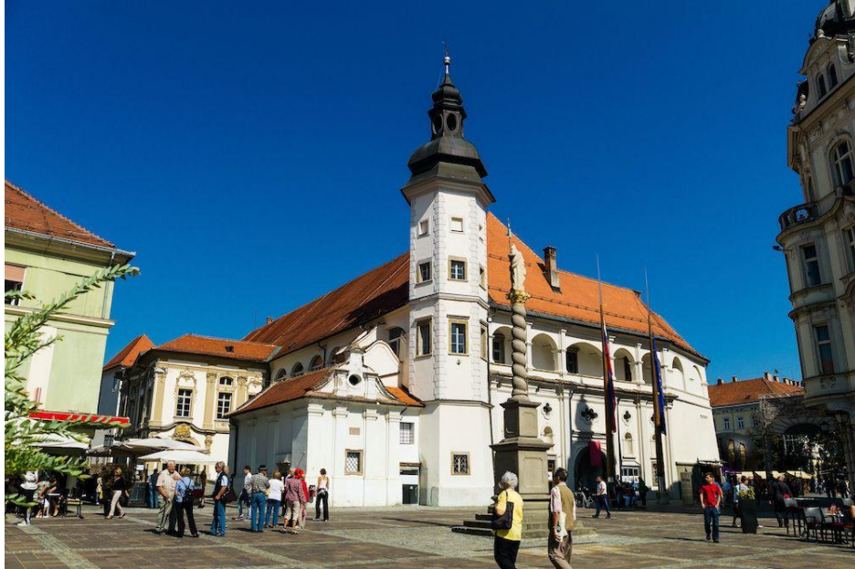
The Maribor castle; a few parts of the original Maribor castle remain, and the building currently houses a museum