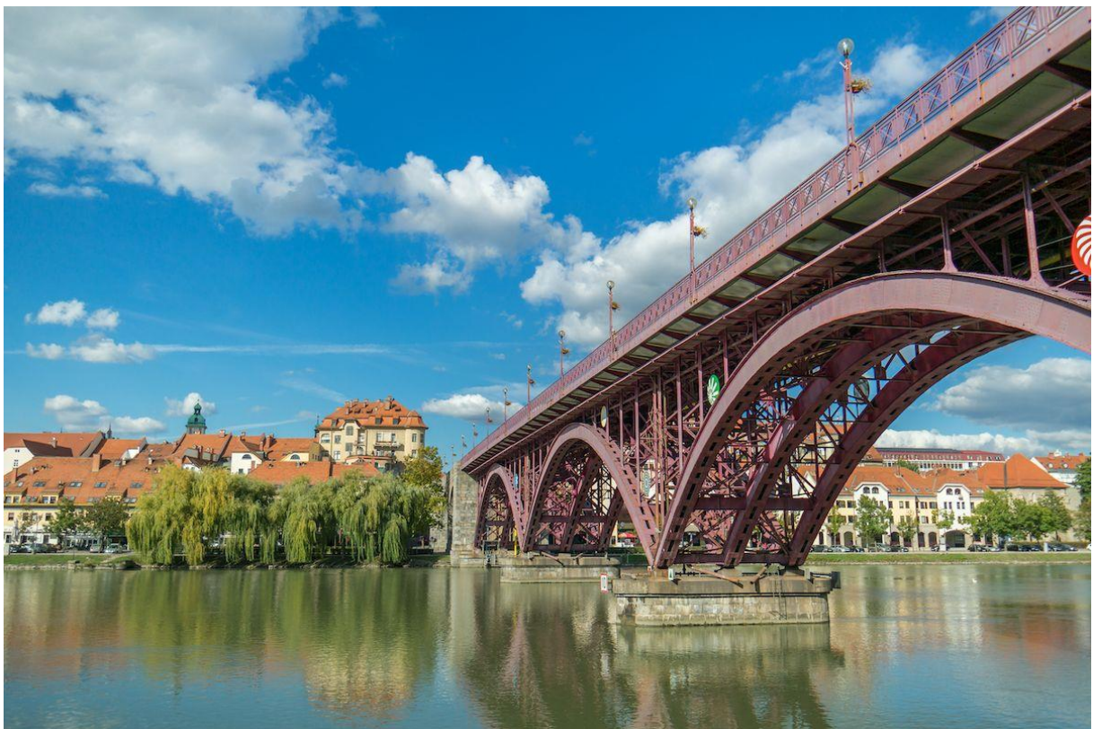
The arches Old bridge (Stari most); built between 1906–1912, one of the most beautiful bridges (at that time - in Austria-Hungary)