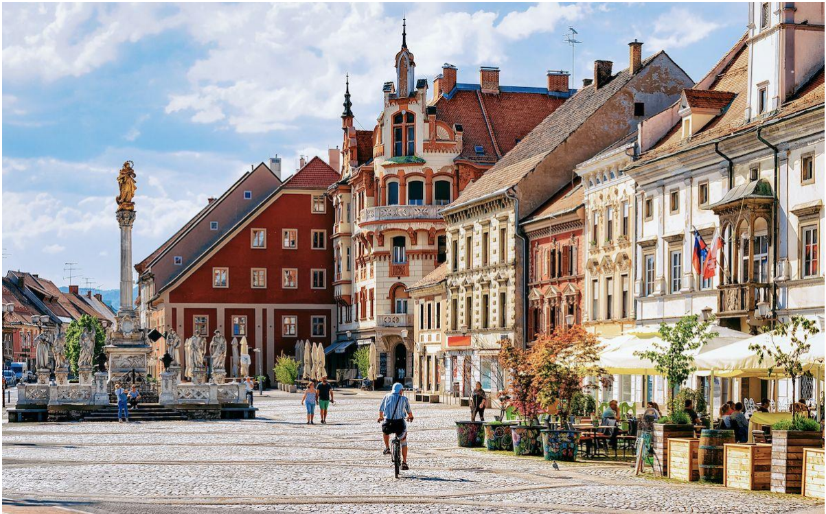
The main square with Plague Monument (Baroque style) erected in 1681 to commemorate the plague that ended a year before.