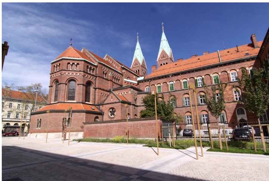
The Franciscan Church, Basilica of Our Mother of Mercy and monastery next to it (Gothic style) – one of the symbols of Maribor