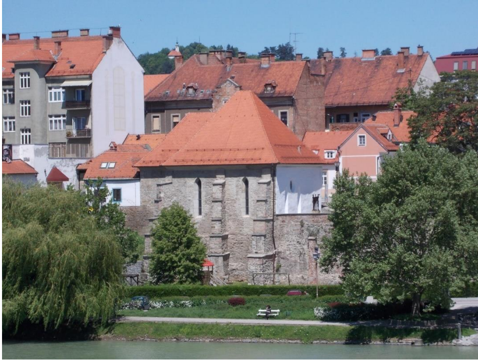
The Synagogue Maribor; one of the oldest preserved synagogues in Europe (from 13th century), currently operating as a museum